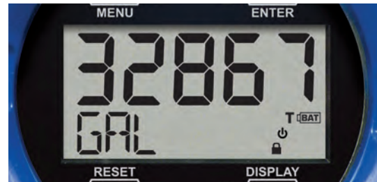
Total on Top Display, Total Units on Bottom

A 5-digit total may be displayed on the top display, with various bottom displays including rate, grand total, units and tags.