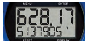
Rate & Total