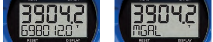
Total on Bottom

The meter can be configured so that the lower display automatically toggles between several displays, such as the total or grand total value, total or grand total units, and a custom assigned tag name. Rate and rate units, total units, or a custom tag may also be selected to toggle. The toggled values will display every 10 seconds for 1-5 seconds; as programmed.