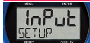
Input Programming Example