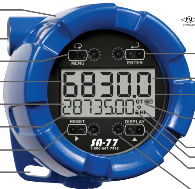
Through-Glass Button Programming