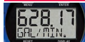
Flow Rate Indicator