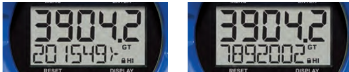
6 Most Significant Digits

The total and grand total may each display up to 13 digits on the lower, 7-digit display. To do this, the display enters overflow mode. The total and grand total will toggle between two displays as shown below.