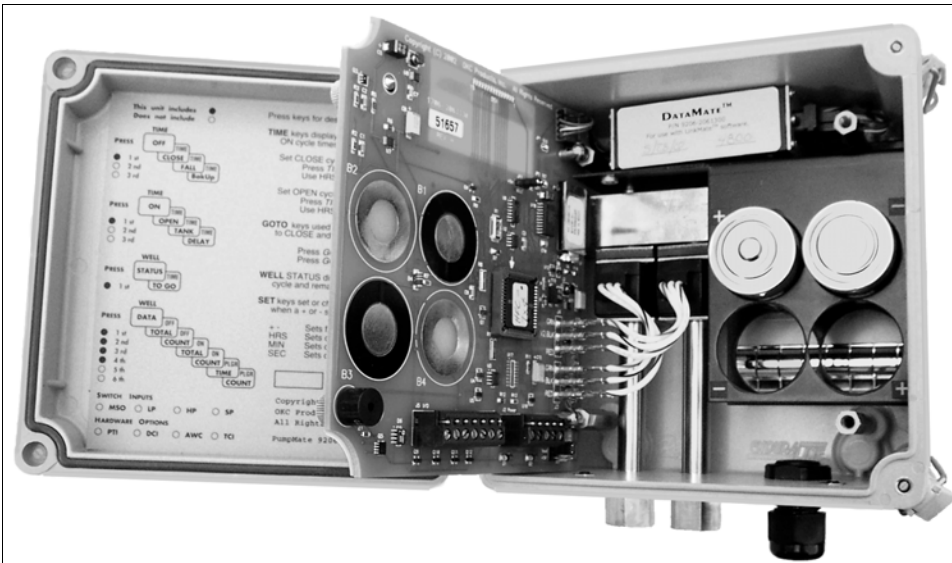
Shown with optional dual valve control and DataMate™ communications interface.